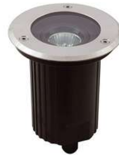
14 Signaling uplights