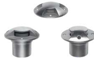
15 Step lights Luminaires