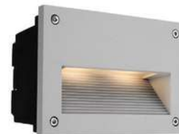
15 Step lights Luminaires