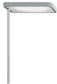
12 Free Standing Luminaires