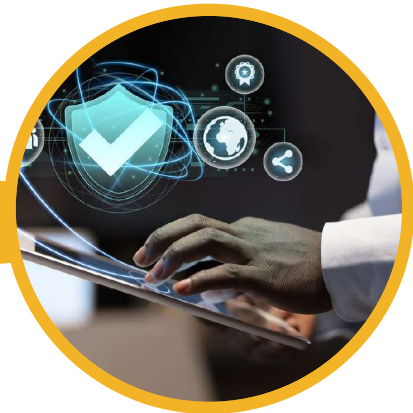
CCTV AND PROTECTION SYSTEMS