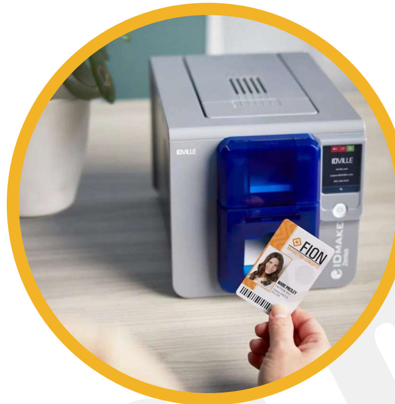
PRINTERS & PRINTING SOLUTION