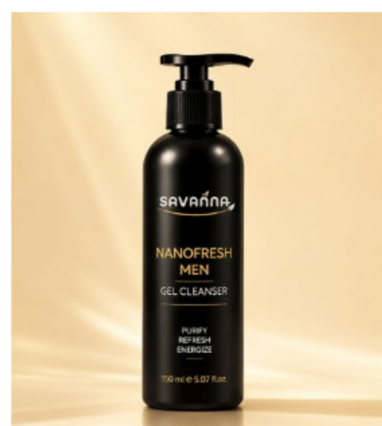
NANOFRESH MEN GEL CLEANSER Savanna, Serum ★★★★★ 89.00 ر.س