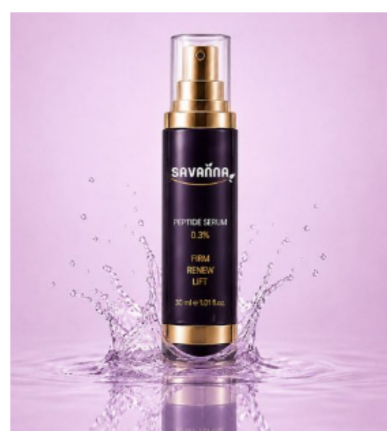
NANOLIFT PEPTIDE SERUM Mist, Savanna, Serum 599.00 ر.س